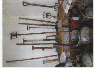
Plot 19 vintage tools

Some owners cultivated their own plots but others rented them out. The Pratt family, for instance, who were druggists and chemists owned Plot 12 for 100 years and Plots 13 and 14 (now built on) for 32 years. They