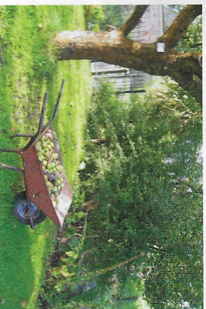
Harvesting for Apple Day

Most of the gardens are accessible by wheelchair, however some paths are narrow and steep in places. We therefore request you to exercise appropriate care taking into account the type of wheelchair and the prevailing conditions. Please ask if you require any advice or assistance.