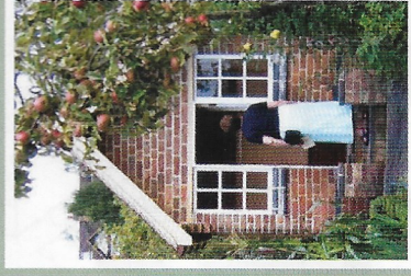
Plot 22 in Autumn

Many volunteers have been involved in the rescue, restoration and continue to maintain the Gardens. The full story of the rescue is told in the Guidebook available in the Centre.