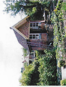
Plot 22 reconstruction

Hill Close Gardens are rare survivors of Victorian detached gardens (once found in many urban areas) used by townsfolk who lived above their businesses in the town centre and had nowhere to grow flowers, fruit or vegetables in their small