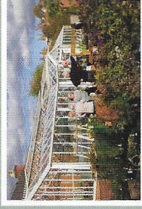
Victorian style Glasshouse

cultivated Plot 12 for the majority of the time. Other owners kept their plots for investment and rented them out for £120-£150 a year.