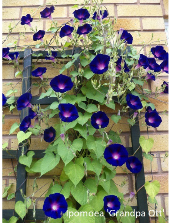
Ipomoea 'Grandpa Ott'